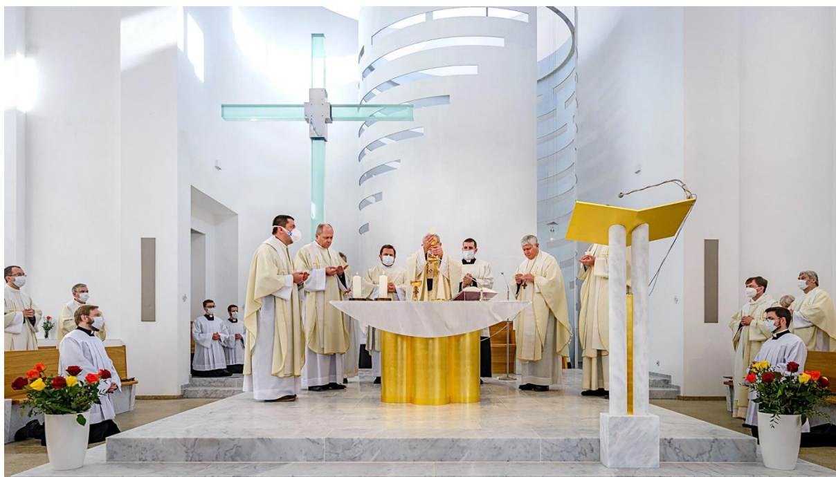
From the Mass in the recently consecrated church of Christ the Saviour in Barrandov (Prague).