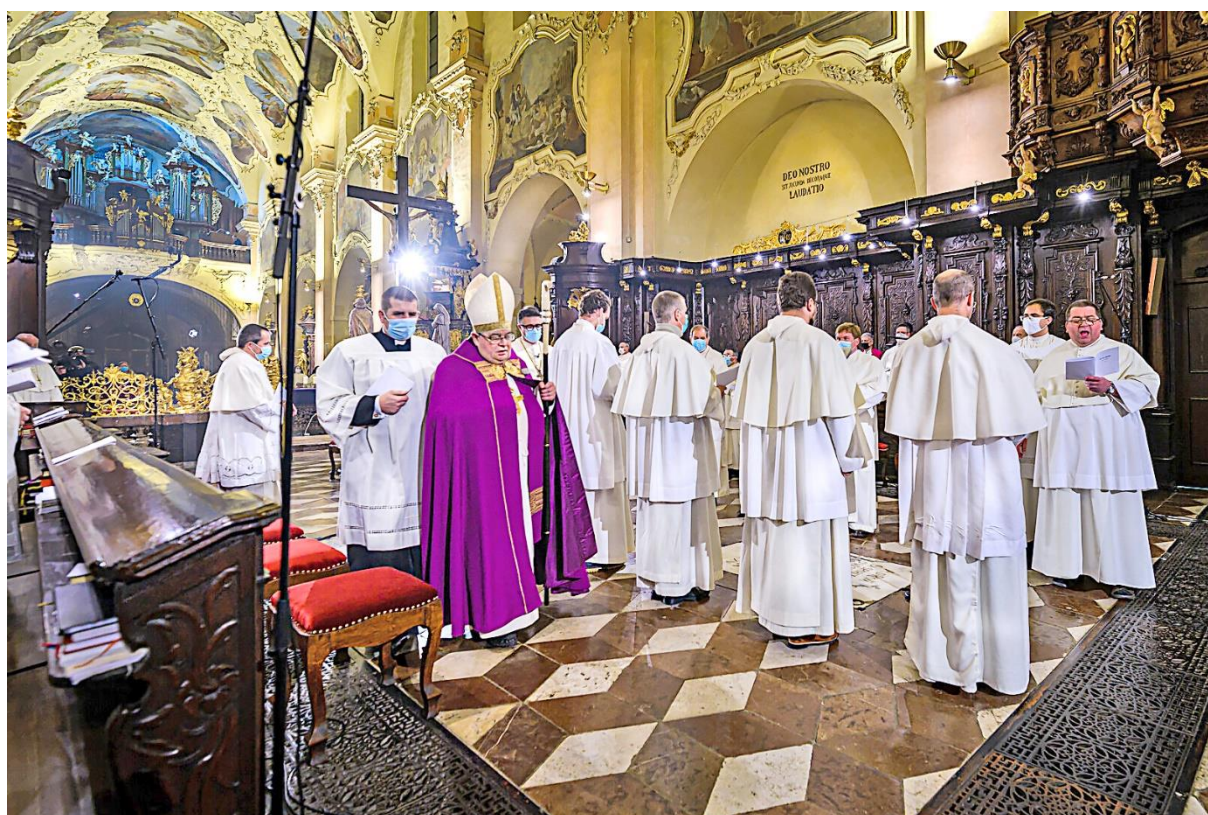
Festive vespers in the Premonstratensian basilica. The number of participants was significantly reduced due to hygienic restrictions.

At the beginning of this year's Advent, on sunset on Saturday, 28 th November 2020, the Royal Canonry of the Premonstratensians in Prague Strahov launched the celebration of the 900 th anniversary of the founding of the order in its monastery basilica of the Assumption with the participation of Prague Archbishop Dominik Cardinal Duka OP. The joint singing of the first Advent vespers was followed by the blessing of new bells and the display of the remains of St. Norbert (1080–1134), the founder of the order, who is buried in the basilica.