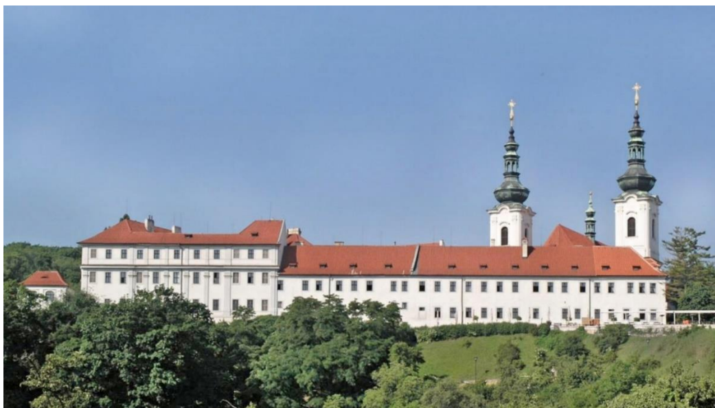
Strahov Monastery and Basilica of the Assumption of the Virgin Mary. The left part of the panorama of Prague as seen from the Vltava river.

The monumental Premonstratensian monastery in Strahov, the seat of Premonstratensian theology students from the Czech lands who study at the Catholic Theological Faculty of Charles University, is the seat of one of the largest publicly accessible libraries in the Czech lands. The basilica and the monastery, together with Prague Castle, form a beautiful and world-famous Prague panorama.